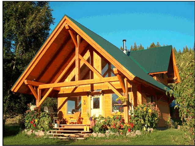
Designed by: Zirnhelt Timber Frames